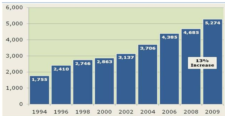
<Figure 1> US farmers' markets