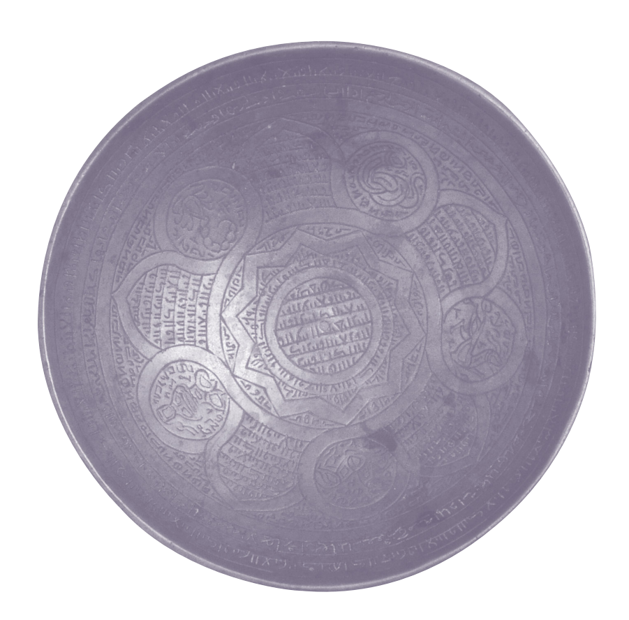
Plate: Magic bowl, Egypt 13th-14th century, from a private collection in Japan

These two projects will certainly be long-term ones but I believe that the steady accumulation of information on the subjects will provide new spheres of research in Islamic art.